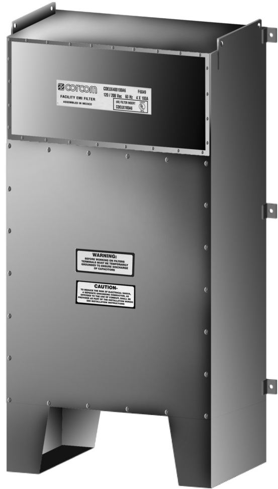
Shown with optional legs Center mounting bracket not installed on all sizes